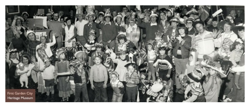
Above Nevilles Road and below Heathermere of Letcworth, Siver Jubilee Celebrations

Any veteran in need of support can contact the Veterans' Gateway – the 24 hour service which signposts ex-forces personnel to the wide range of support available to them, including housing and financial advice, career guidance, and medical care from the NHS. Since being set up in 2017, the Veterans' Gateway has already received over 20,000 contacts, advising ex-forces personnel and their families.