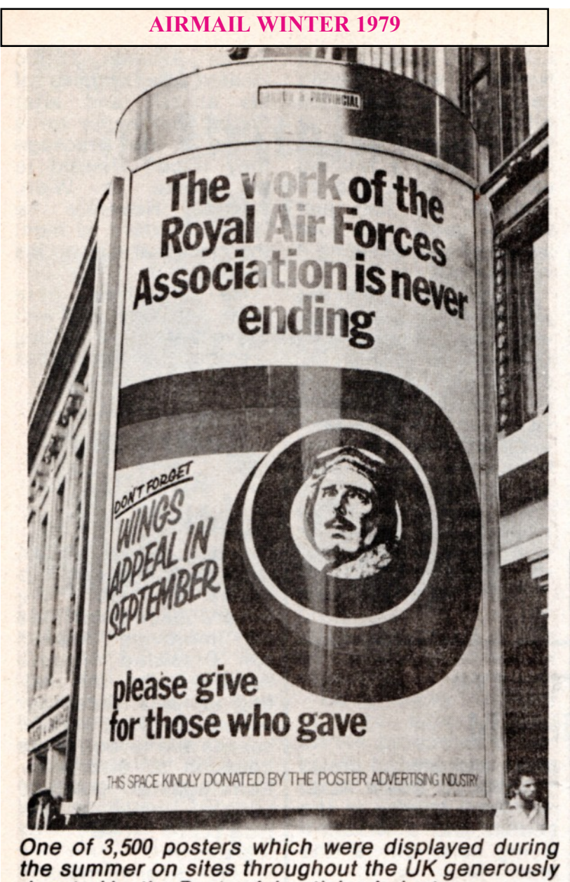
donated by the Poster Advertising Industry. This revolving stand is outside Selfridges in Oxford Street, London.