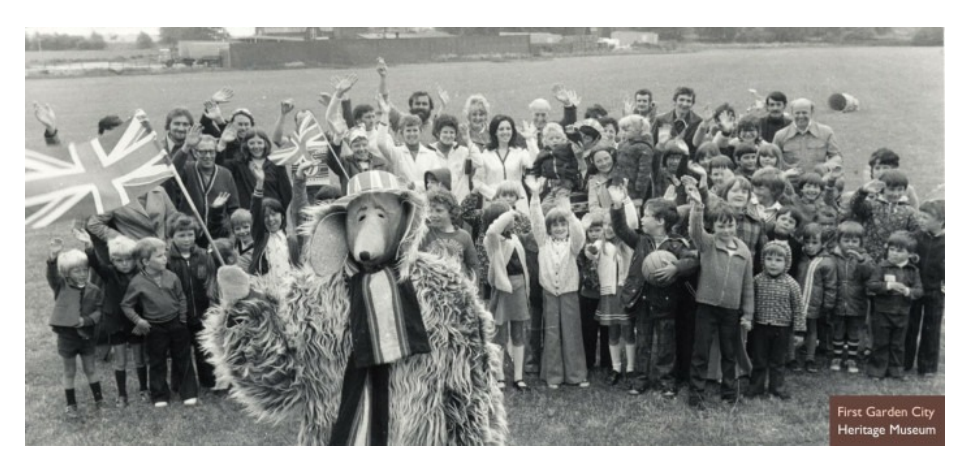
Siver Jubilee Celebrations Upper Maylins Letchworth