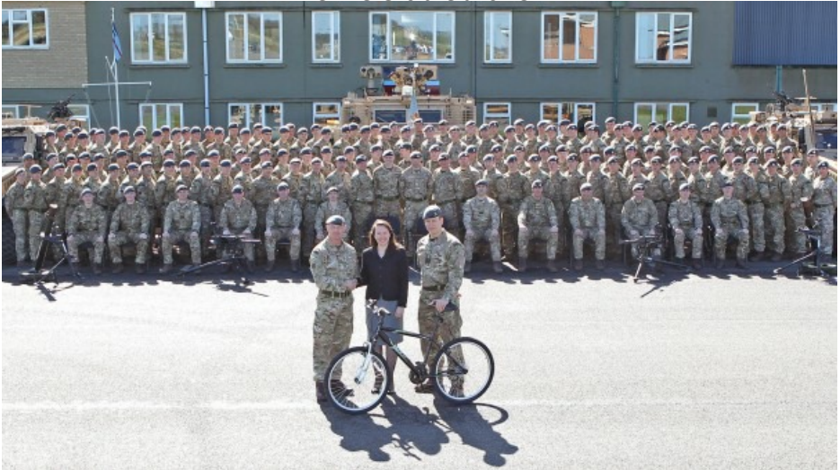
15 Squadron get on their bikes