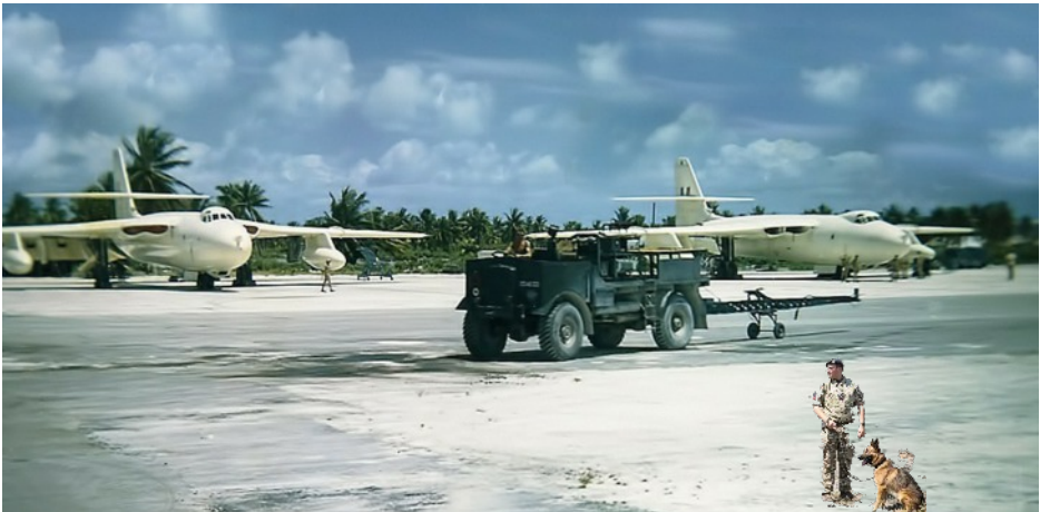
RAF 49 Sqd on Christmas Island