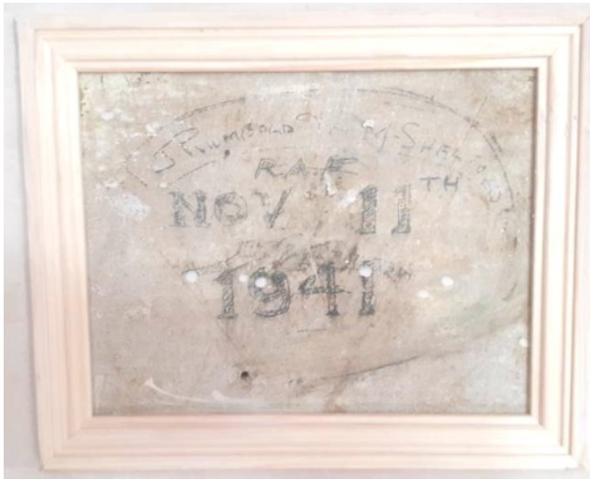
The wall painting with the letters R.A.F. & 1941 found in a home in Letchworth

I am hoping when times change and can get out and meet people, I will be able to report more. In the meantime if you think you might be able to help with my enquiries, please contact me. Details on the second page.