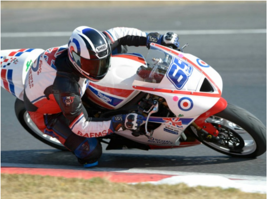
Royal Air Force Motorcycle Road Racing.

beer saw us complete a ride which had been 6 months in the planning. The event organisers would like to thank all who have donated, and who hosted the ride at the various venues, to the general public we met on the day. Perhaps for the 80 th anniversary we might attempt an even bigger ride.