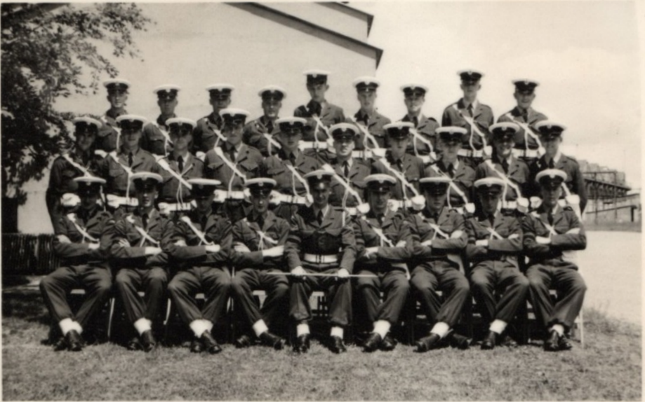
A bunch of Snowdrops on Salisbury Plain 1956