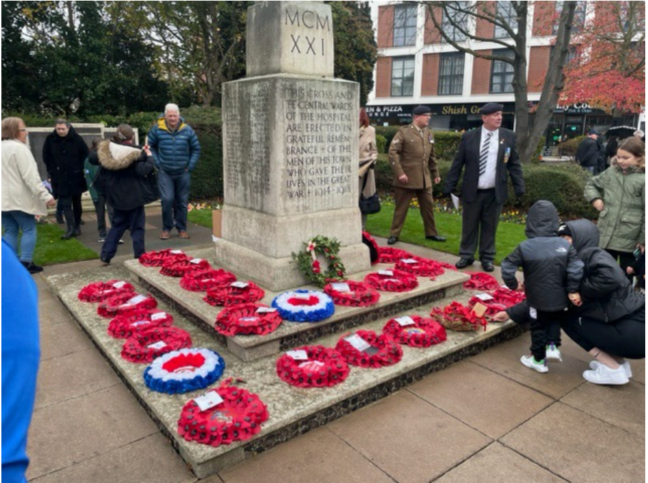
The public view the wreaths after the service at Letchworth