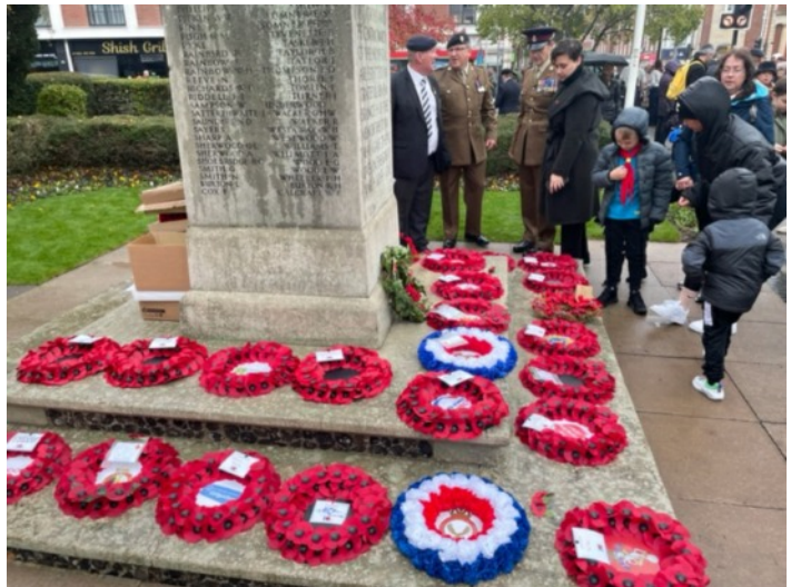
The branch wreath is the one on the top step.