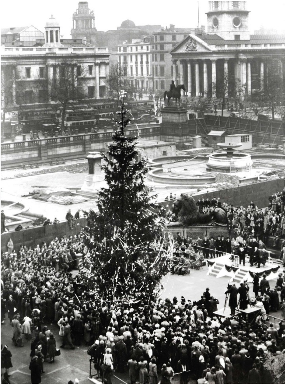
Photograph showing the first Christmas tree to be sent from the people of Oslo in Norway and displayed in Trafalgar Square in 1947. Now an annual tradition in recognition for the support given by the British to Norway during the Second World War